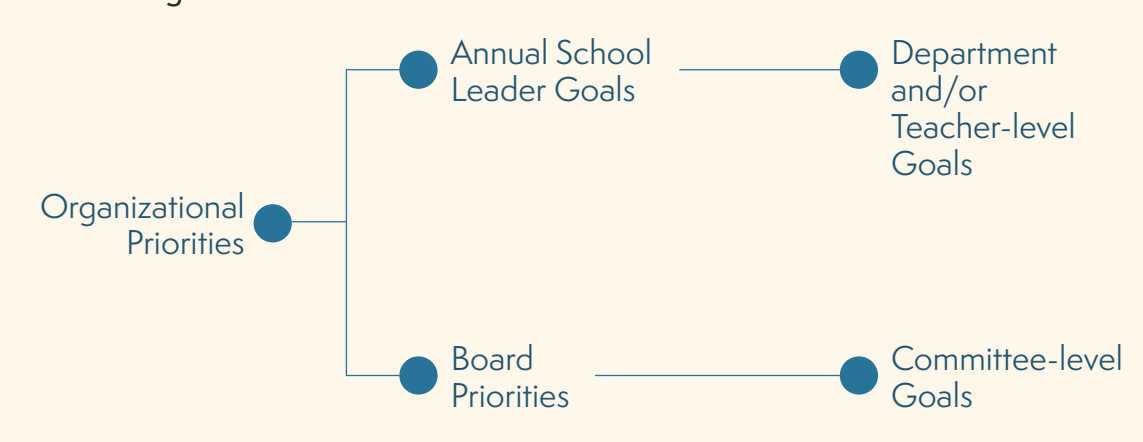
Figure 2. Breakdown of Priorities and Goals for Board and Staff

As demonstrated in Figure 2 below, the process starts with a collective understanding of organizational priorities, which are the most important tasks the organization needs to complete for the year. From there, it's a cascading effect. Each of the two main partners—the board and the school leader—will identify how they will add value to the school or the organization in service of organizational priorities.